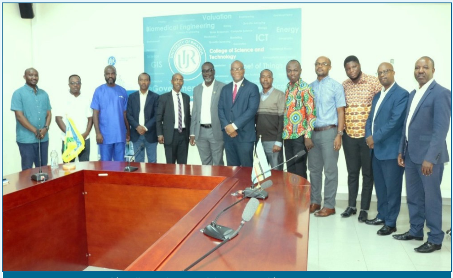
After discussions, participants posed for a group photo

n 20<sup>th</sup>, May 2022, a team of researchers from Kwame Nkrumah Science University of &Technology ( KNUSTGH ) paid a courtesy visit to African Centre of Excellence in Internet of Things us to explore different collaboration under areas an existing partnership with University of Rwanda.