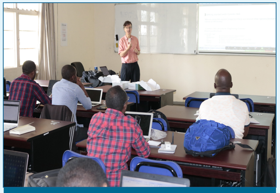
Summer school session at ACEESD

CEESD, ACEIoT, Coventray University have organized a three-day summer school for postgraduate Masters and PhD students, and early career researchers where they got the opportunity to learn from leading researchers in IoT and Energy. The summer school took place from 27th through 29th June 2022.