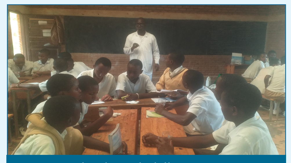
Learning session in Nyarugenge

he ACEITLMS Master's students together with UR-CE Bachelor's students under the supervision of the Head of Research conducted outreach programs in primary and secondary schools to equip science teachers with skills in the use of practical-based lessons in Mathematics and Science education. The outreach took place in May and June 2022 in different primary and secondary schools in the Eastern province and in the City of Kigali.