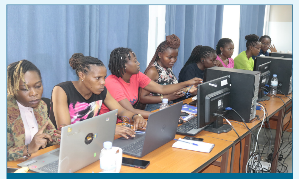
PhD and MSc students pose for a group photo after the training

5 Twenty females young graduate graduates are undertaking a four-month training to build their IoT related business and entrepreneurship skills capacity in ICT. The training is also meant to enhance ICT skills for job creation and competition through small business ideas.