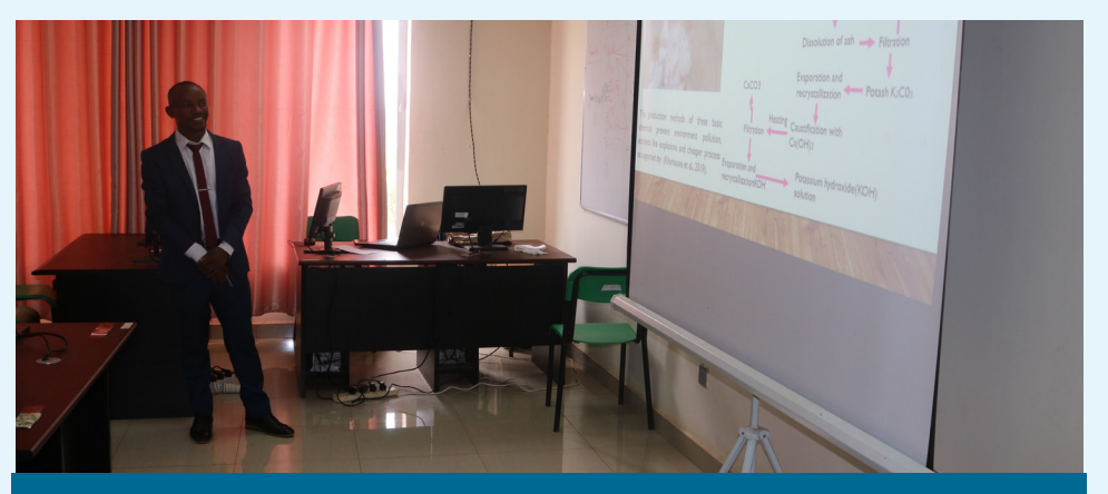
After discussions, participants posed for a group photo

During this exercise, external examiners who were selected based on their qualifications and expertise as well as internal examiners participated in Viva-voce as members of the committee for oral examination and produced comprehensive examination reports.