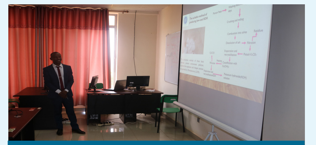
Cooking stove is one of exhibited innovations

At the end of the workshop, three persons were awarded the certificate as master trainers of interactive mathematics software.