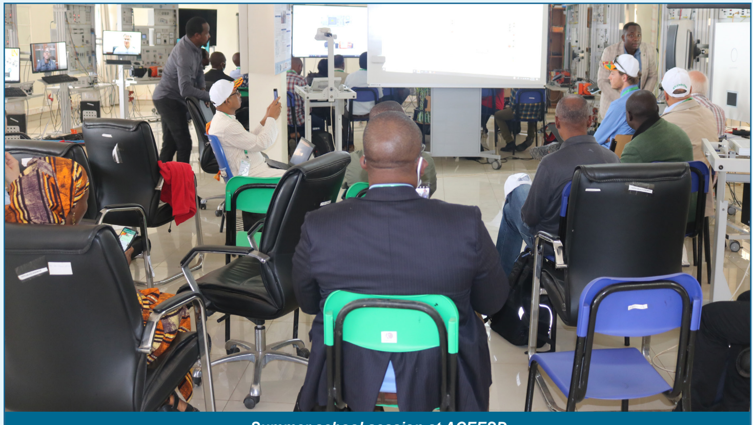
Summer school session at ACEESD

rom 22nd to 26th August, Rwanda hosted the IEEE PES/IAS Power Africa Conference 2022. The conference took place in Kigali with participants from across Africa and the world to explore energy and electric power infrastructure developments in Africa.