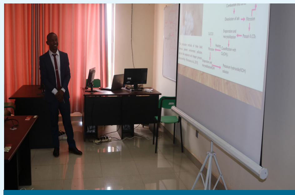
A young incubatee exhibiting his energy innovation

he African Centre of Excellence for Innovative Teaching and Learning Mathematics and Science (ACEITLMS) in collaboration with SAKURA-SHA K.K, a private company registered in Japan have jointly organized a one-day on 19th August 2022 at UR-CE Remera Campus training of teachers and lecturers on Mathematics teaching method utilizing hand-made teaching/learning tools.